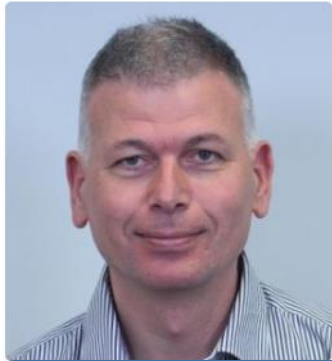
Fluor AAD ZWAAN